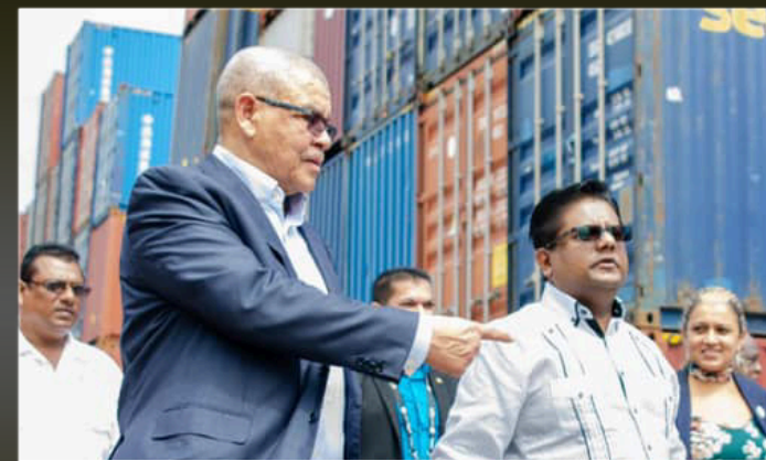
Official Visit to John Fernandes Wharf