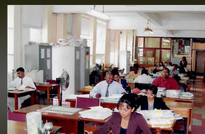
Liabilities Section - GPOC Building