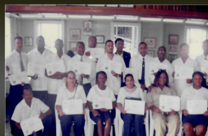
Customs Officer III Graduates 2001