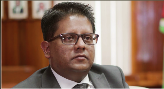
Senior Minister in the Office of the President with Responsibility for Finance - Dr. Ashni Singh