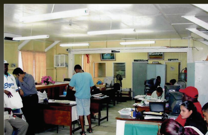
Licence Revenue Office Smyth Street