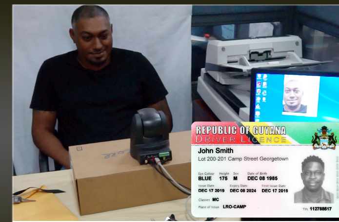
Licence Revenue Processing System